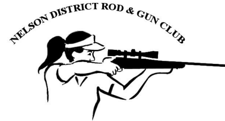
Ladies Target Shooting