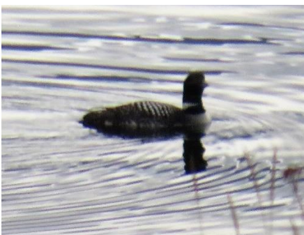
Loon on Kootenay Lake