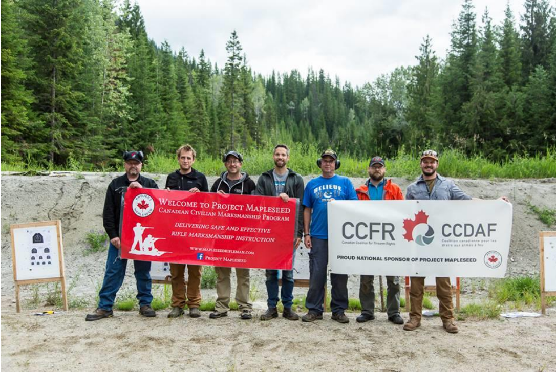
4. Only seven stayed to bear the banners at the end of the day