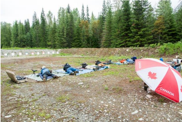
1 - The Firing Line