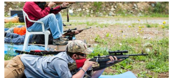
2- The author firing the only centrefire rifle on the line, a Ruger Scout Rifle in .308 Winchester

Our scaled targets simulate shooting out to 400m, and though many of us shot well – and shoot better now than we did before – the