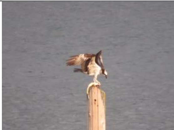
Osprey on Kootenay Lake, Sept 7, 2018.

Ospreys may log more than 160,000 air miles over a lifetime. One female Osprey in Massachusetts, which researchers tagged in 2008 and named Penelope, headed south in early September, later reaching the Bahamas. After pausing in the Dominican Republic, she traveled to the Island of Birds, off Venezuela. She had covered nearly 3000 miles. After a side trip to the Amazon, Penelope spent the winter on a remote jungle river in Suriname.