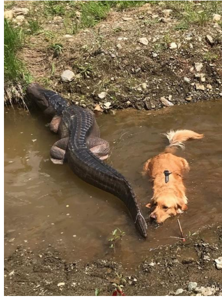
Bella, cooling off.