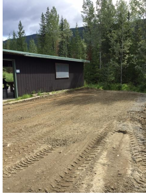
The pad for the concession area will be behind the rifle shelter.