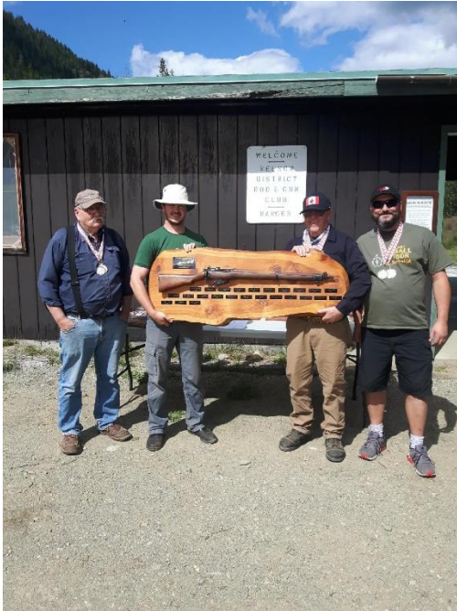
Fred Watson Memorial Trophy