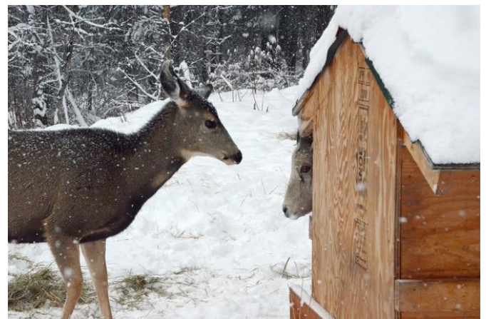
Jan 15/10