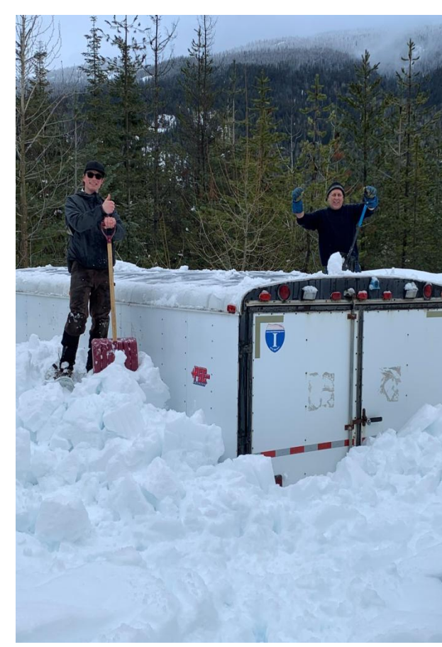
Job well done!