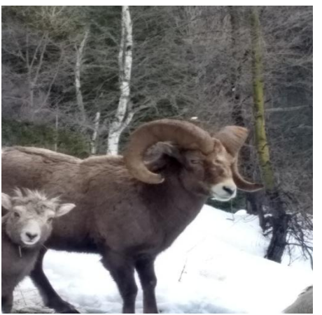
Jan 25/20