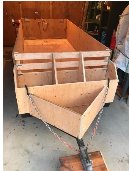
Wes Smith completed the trailer.