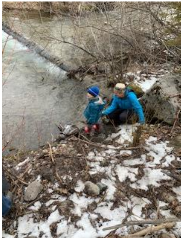
Hume Elementary School Kokanee Fry release at Cottonwood Creek.