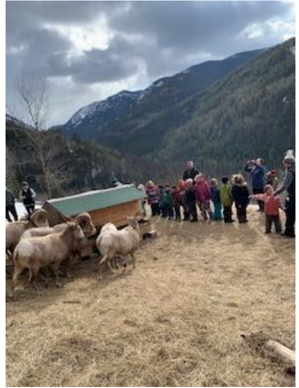
Salmo Elementary Grades 1-2 enjoying the sheep feeding station.