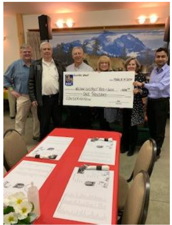
Thank you to RBC for the donation of $1000.00