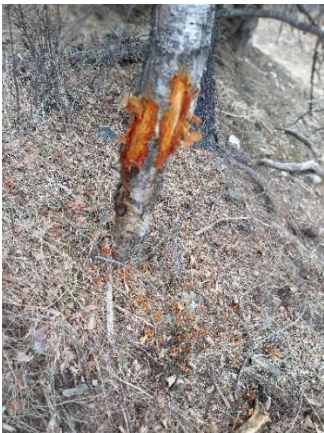
March 20, 2021. Fresh rub on tree at feeding station.

See you next December when we start with another year of our sheep feeding program.